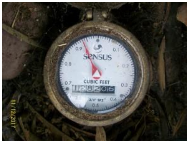
Analog water meter

Non-wireless, old-style analog water meter emits zero radiation. Neighborhood has low levels – 0.0007 milliwatts per meter squared, or lower.