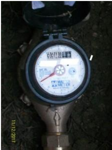
Ramona's new smart water meters look like this one.