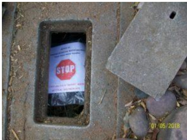
Do-not-install smart water meter sign inside meter box.