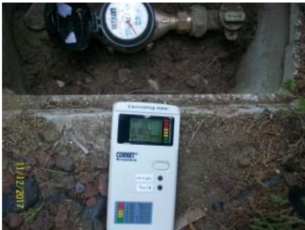
Smart water meter shows two spikes at peak of 2.4 milliwatts per meter squared (mwm 2 ). Close-up below.